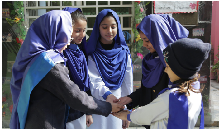
Lahore: Girls at the Scholars School System participate in a team-building exercise

65 young boys and girls from low-income families get assistance from Zaman Foundation for primary and secondary education at the Scholars School System, situated at Badami Bagh, Lahore.