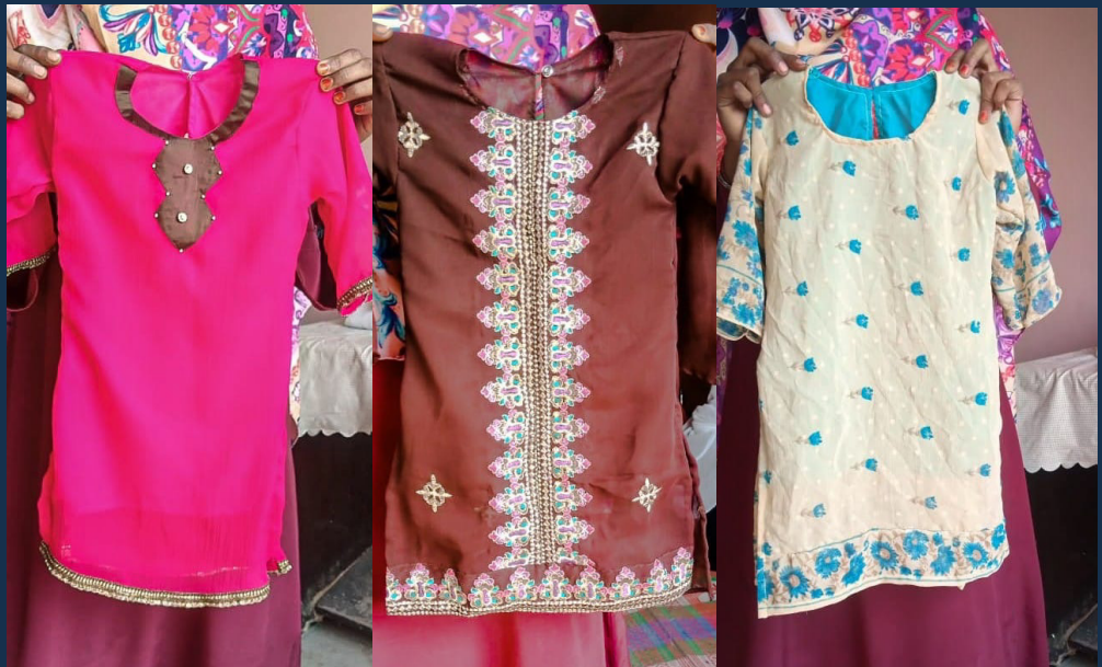
Hajikot: Cut, designed, stitched and hemmed by trainees at ZF's vocational training center.

With a vision to enhance livelihoods in remote communities of Hajikot and Islam Nagar, 61 girls are being professionally trained for stitching and tailoring at ZF's VTC. Check out these stellar outfits, stitched and hemmed by our super talented trainees.