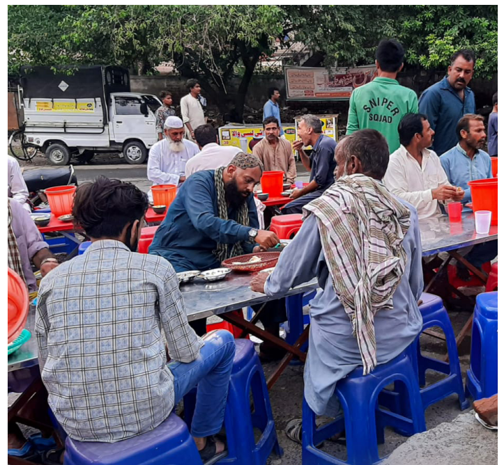
Lahore: Daily wagers enjoying their evening meals at ZF's partner soup kitchen in Shah Jamal.

EVERY MONTH, 100,000+ FREE MEALS ARE SERVED ON A WALK-IN BASIS AT ZF'S PARTNER SOUP KITCHENS. START YOUR YEAR WITH SHARING A MEAL FOR JUST PKR 65/-