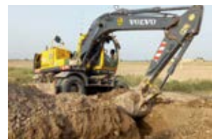
Excavation and digging is done for 48 homes