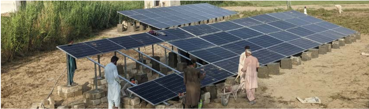
Tamman: 60 KW of clean, renewable power is providing 200,000+ liters of clean water, daily. READ MORE ON PAGE 2

ZF BECOMES ELIGIBLE TO PARTNER WITH THE UNITED NATIONS FOR ITS CASH-BASED TRANSFERS PROJECTS IN PUNJAB AND SINDH.