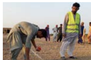
Landmarking and demarcation is done for 50 homes