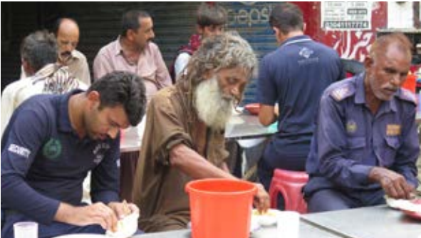
Lahore: Over 1,200+ people are fed nutritious meals daily from ZF's partner soup kitchens.