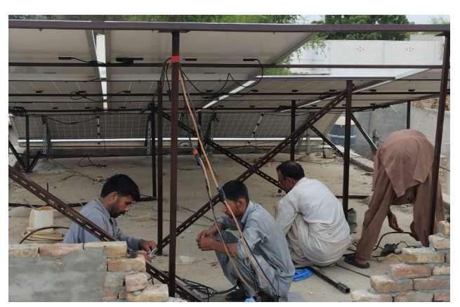
HASILPUR: Villagers working on the solar panels.

This is the power of community partnership. Together, we've not only provided a solution to a pressing problem but also empowered a community to shape its own future. See how this manifests in other communities: