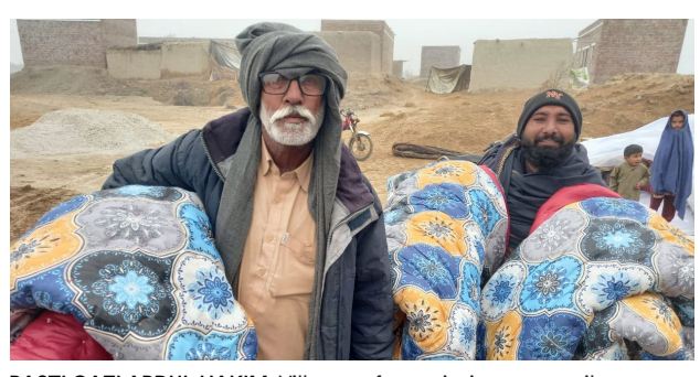
BASTI QAZI ABDUL HAKIM: Villagers after recieving warm quilts.

Last December, ZF distributed especially designed winter kits among 500 families across Lahore, Southern Punjab and parts of Balochistan. The kits included essential items to shield against the harsh winters, including warm quilts and woolen socks. You can donate to this year's Winter Drive through sabsaath.org.